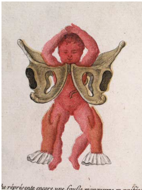
Figure 2 Depicts a breech birth with the placement of the accoucheur's hands.