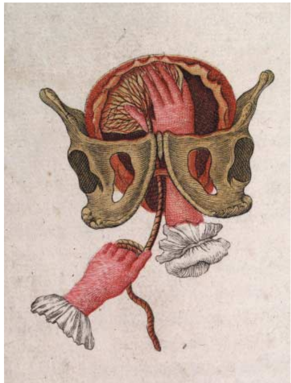
Figure 3 Manual removal of the placenta.