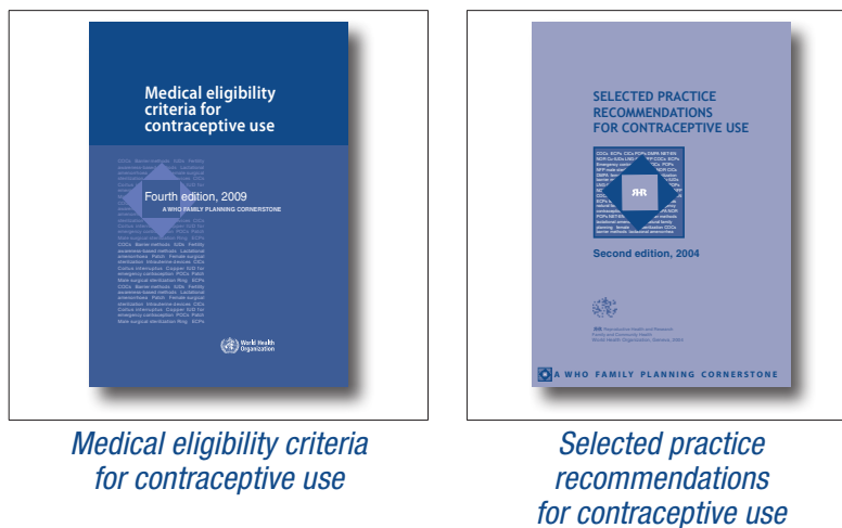
Figure 1. The four cornerstones of family planning guidance

These are evidence-based guidance and consensus-driven guidelines. They provide recommendations made by expert working groups based on an appraisal of relevant evidence. They are reviewed and updated in a timely manner.