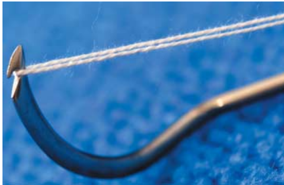
Figure 2 'Frank Forster needle' detail (Royal Australian and New Zealand College of Obstetricians and Gynaecologists Museum – Photographer, F Artuso).

Over the years, Forster delivered many papers at medical history conferences in Australia and overseas, where he met other medical and social historians. He continued to maintain contact with these historians as is evident from his personal papers held in the Archives of the Royal Australian and New Zealand College of Obstetricians and Gynaecologists (RANZCOG), as it is known now following the amalgamation of the two colleges. Forster was particularly interested in the life and work of Australian gynaecologist Norman Haire, known for his outspoken writings on birth control, sex education and sexual reform. Forster held the Norman Haire Fellowship, University of Sydney, for two consecutive years in 1978 and 1979. He had intended to publish the results of his research in a book on birth control in Australia, but unfortunately this was never accomplished due to bouts of ill health in his later years.